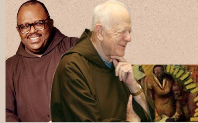
A Ministry of the Capuchin Province of St. Joseph

The House of Peace is a 501 (c) (3) ministry. All donations are tax deductible as allowable by law.