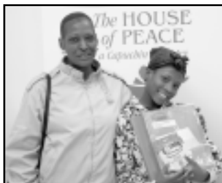
Left: Mother and daughter share some of the new school supplies they received.