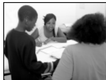
Right: Mother and son prepare to receive supplies for a new school year.