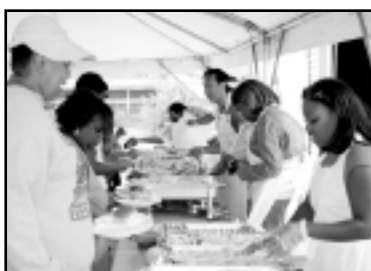
Left: Volunteers line up for a picnic dinner served by staff.