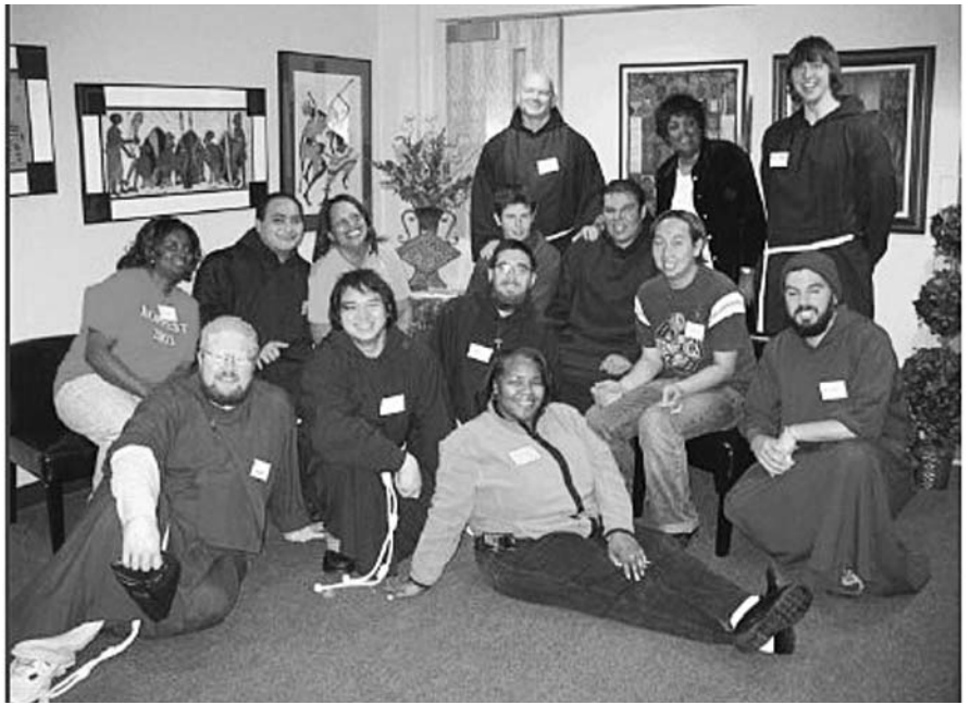
Above: Capuchin Novices visited the House of Peace and filled food boxes. They posed for a picture with staff and volunteers.

The House of Peace is a 501 (c) (3) ministry. All donations are tax deductible as allowable by law.